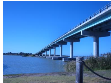
Hindmarsh Island Bridge