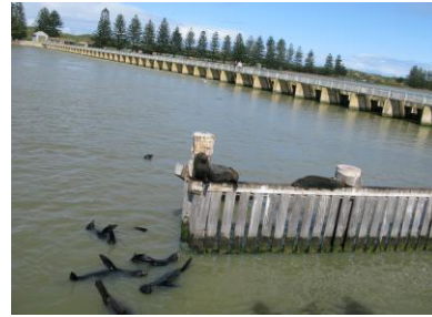
Seals playing, Goolwa Barrage