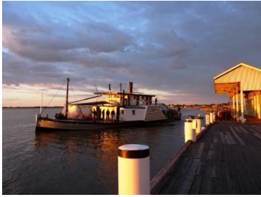
PS Oscar W, Goolwa Wharf